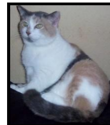
Lending a Helping Paw... Olive